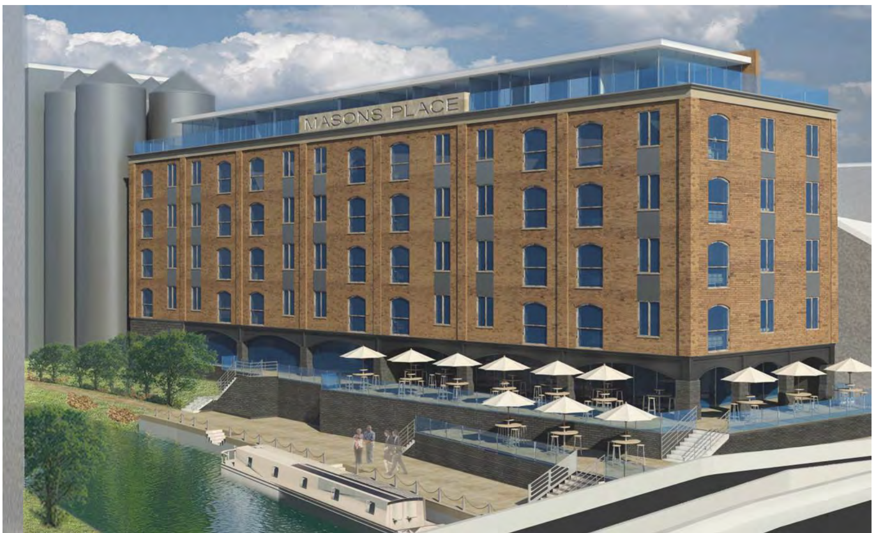
Stonecutters Yard | Proposed redevelopment | Public Consultation | October 2015 View from bridge on River Stort.