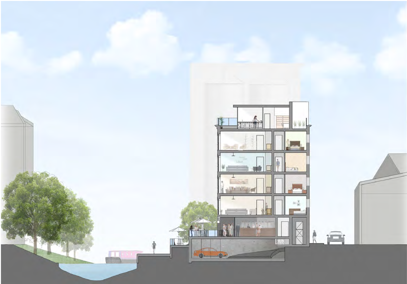
Stonecutters Yard | Proposed redevelopment | Public Consultation | October 2015 Typical section