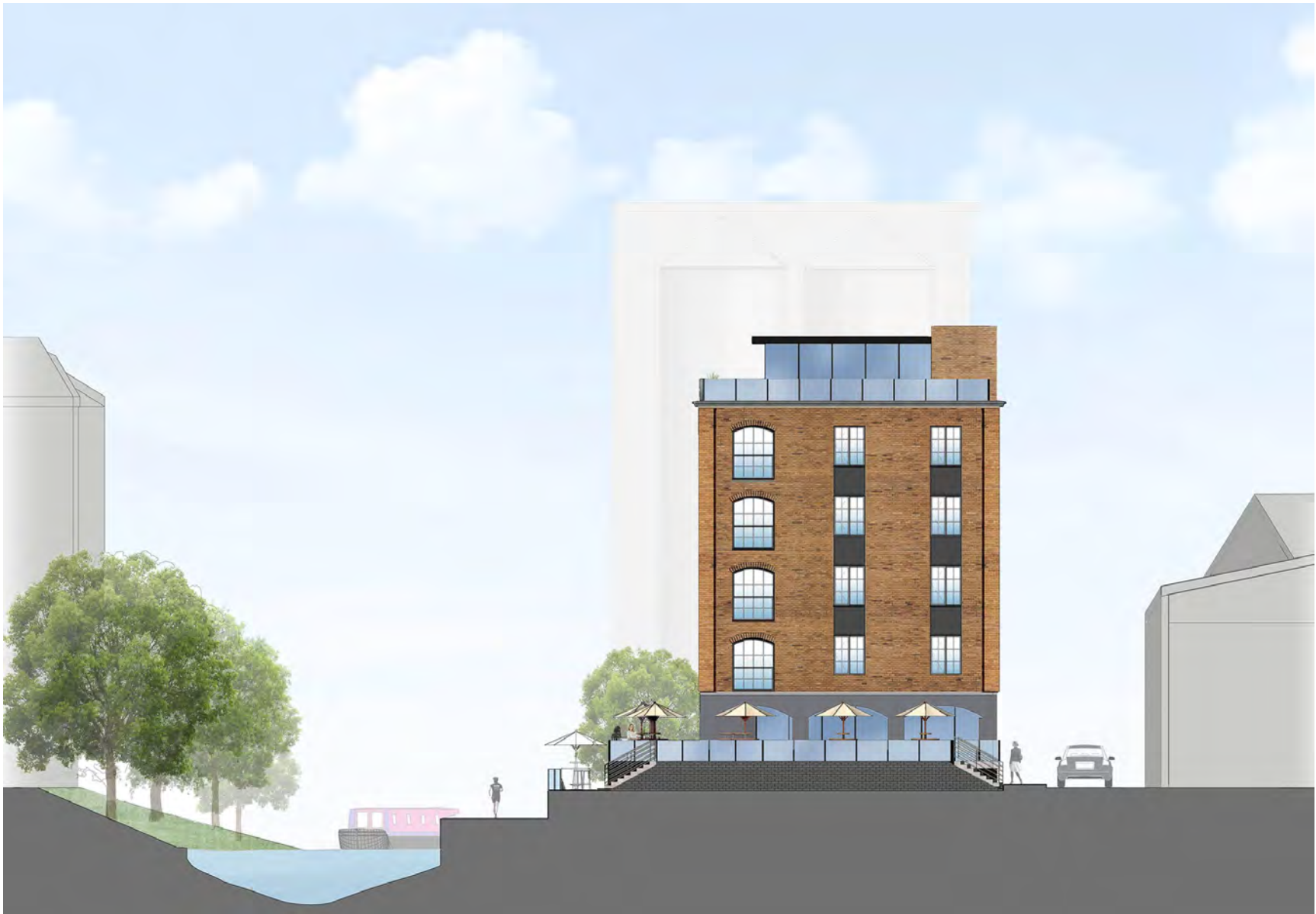
Stonecutters Yard | Proposed redevelopment | Public Consultation | October 2015 Road Elevation