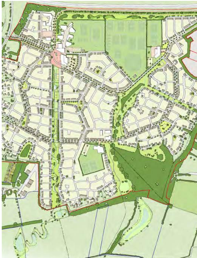
Indicative Masterplan - Barton Wilmore

Bourn Airfield has been promoted for the Taylor Family and Countryside Properties since 2000 through various stages and reviews of the development plan process. Following publication of the NPPF 2012 and acknowledgement by South Cambs DC that it had to plan for its objectively assessed needs and identify more sites for development, Bourn Airfield was identified as an option to create a new village for 3,500 homes on a former WWII airfield. AM-P prepared a promotion document and submitted representations to all stages of the emerging Local Plan, resulting in its allocation in the 2018 adopted South Cambs Local Plan.